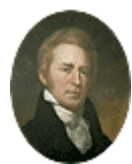
Lewis and Clark