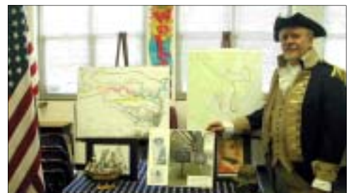
Oglethorpe Point Elementary School on St. Simons Island had a visitor - Colonel Samuel Elbert .