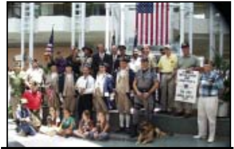
Flag Day Ceremonies at North Point Mall where GASSAR presented a Flag Certificate to the mall.