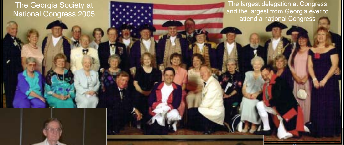
The largest delegation at Congress and the largest from Georgia ever to attend a national Congress