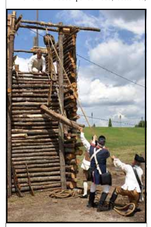
Building a replica Maham Tower

The weekend began on June 2nd with a symposium, "Fighting for Augusta", at the Augusta Museum of History. The parish hall of historic St. Paul's Episcopal Church was host that evening to a sumptuous Colonial Dinner that included period food, costumes,