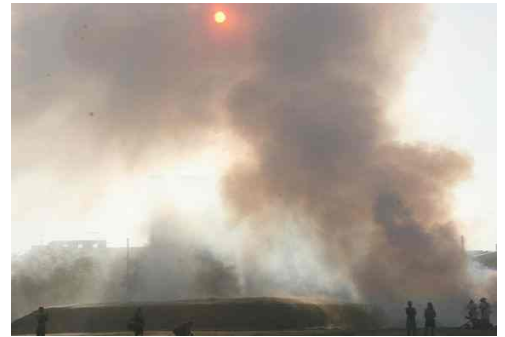
Cannon smoke and fog loom over Spring Hill Redoubt