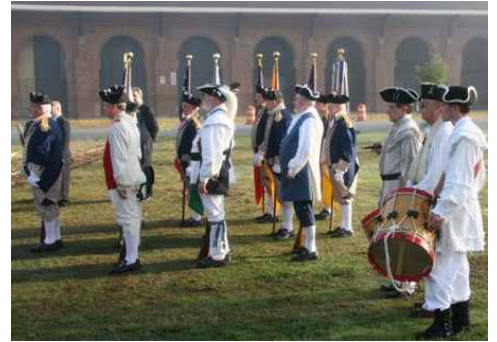
Color Guard at Battlefield Memorial Park

Before leaving Savannah, the Georgia Society group moved to Monument Park to pay tribute to Polish Gen. Casmir Pulaski, a friend of America and a casualty of the Battle in Savannah in 1779.