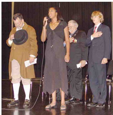
Students at Kell High School participate in Sons of Liberty Education Outreach Program.