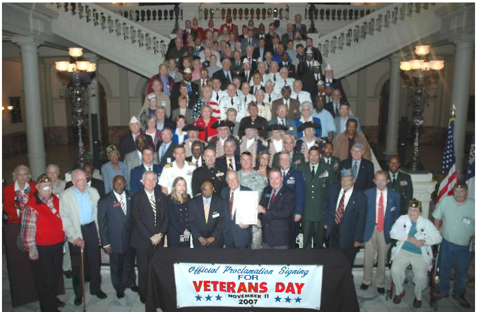
Georgians from numerous veterans' organizations and groups gathered at the Capitol for the official proclamation signing for Veterans' Day, observed on November 11. The Georgia Society was represented in the group. (Center, Fourth Row)