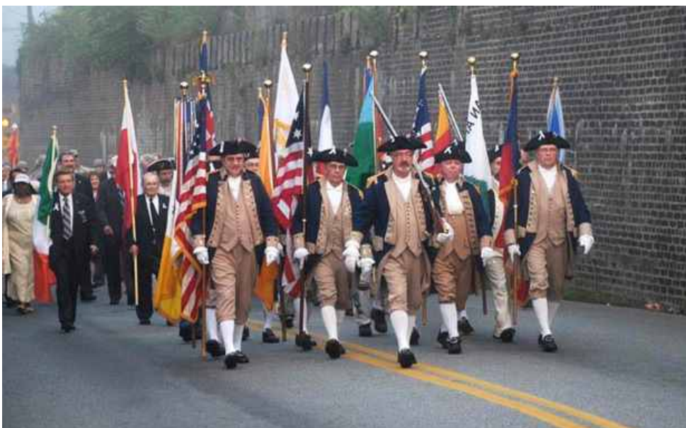
The Georgia Society Color Guard leads the parade to the Spring Hill Redoubt on a foggy morning reminiscent of the day of the fateful battle 228 years before.