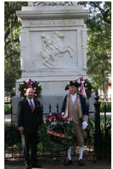
Polish Attaché with Ga Society President at Pulaski Monument Ceremony