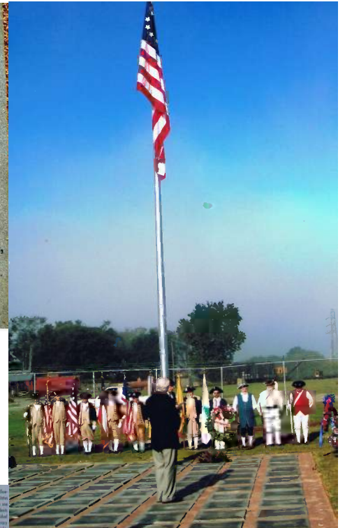
Battlefield Memorial Park Monument Savannah, Georgia