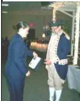
Presentation at East Paulding High School in Dallas, GA

Members of the newly chartered Sons of Liberty Chapter participated in the Scout Day at Marietta's National Cemetery and Memorial Day activities at the Marietta National Cemetery and in downtown Dallas.