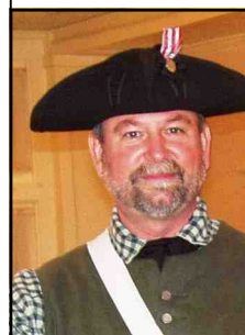
Georgia Society Registrar