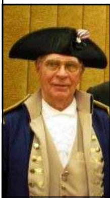
Georgia Society Genealogist