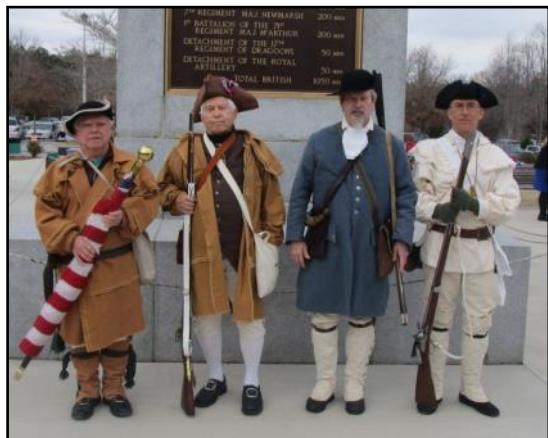
Blue Ridge Mountains Compatriots attended the Cowpens battle commemoration.