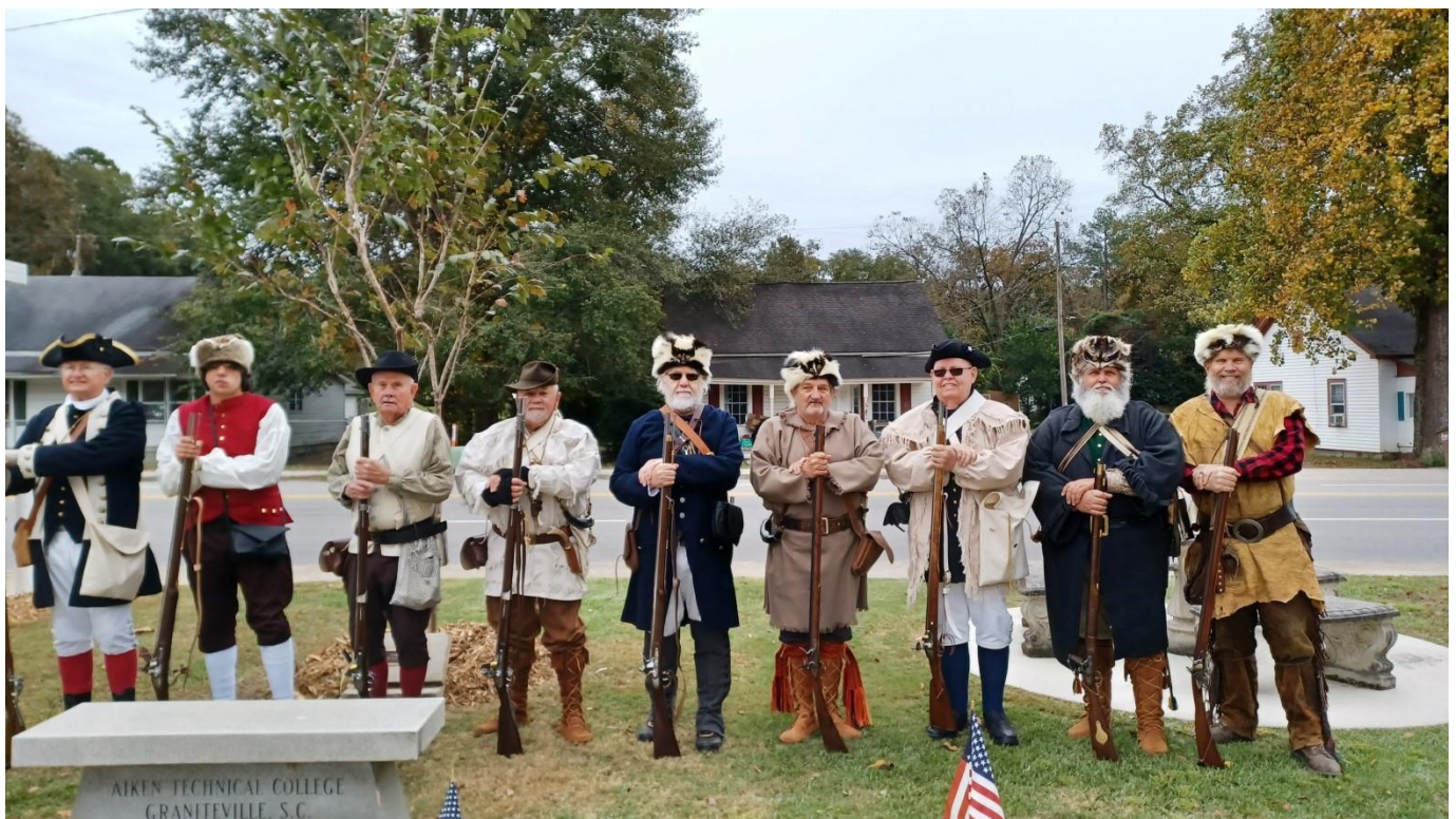
Photo #1: 9 GA and SC Sons of the American Revolution militia lined up to fire there 50 Cal. Pennsylvania/Kenturcy flintlocks.