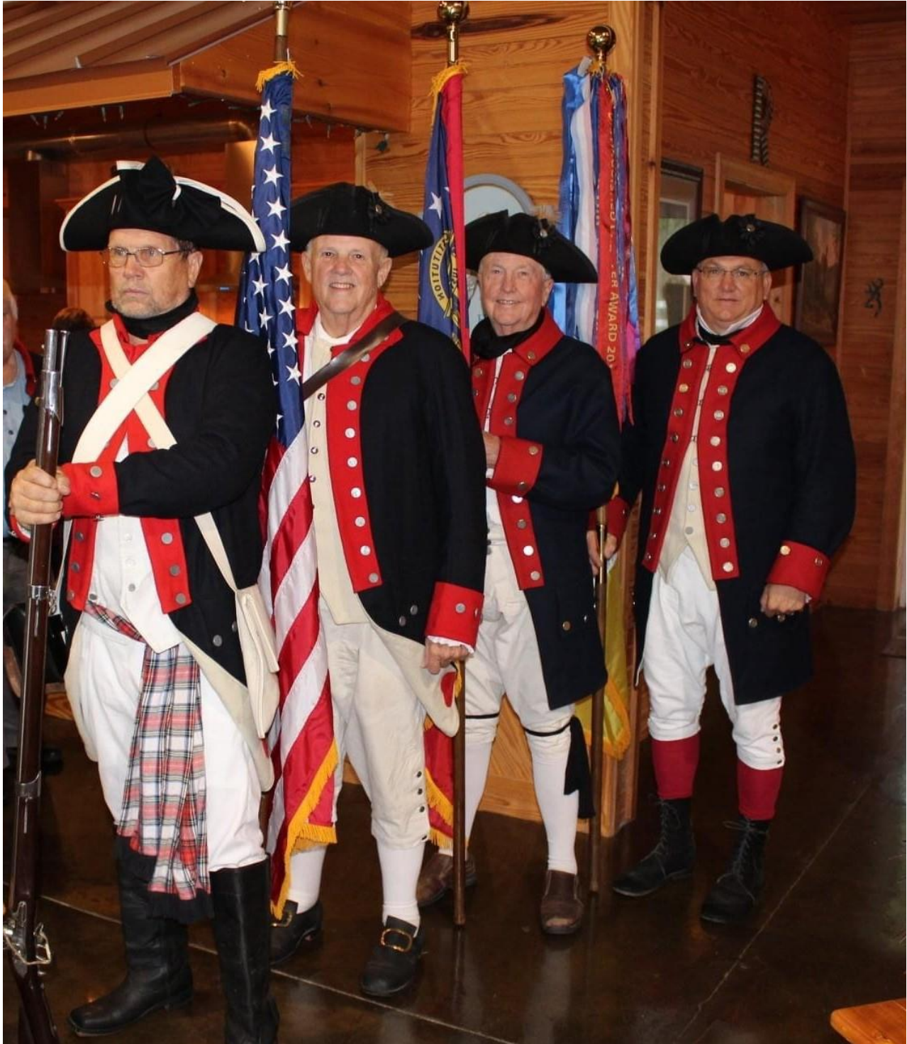
"Second Siege of Augusta Event held"