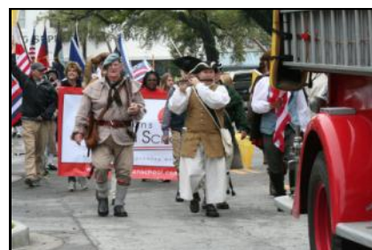
Fife and drum