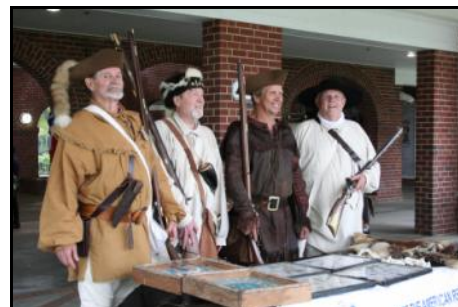
Members of the Wiregrass Chapter