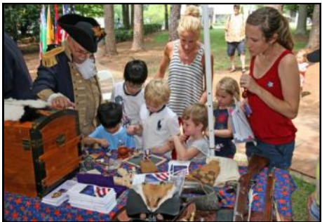
Children enjoying the items from the Traveling Trunk