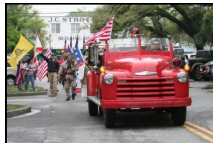
Antique Fire Truck leading the parade