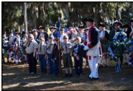
NSSAR President General with Webelos Scouts, Pack 7, Savannah