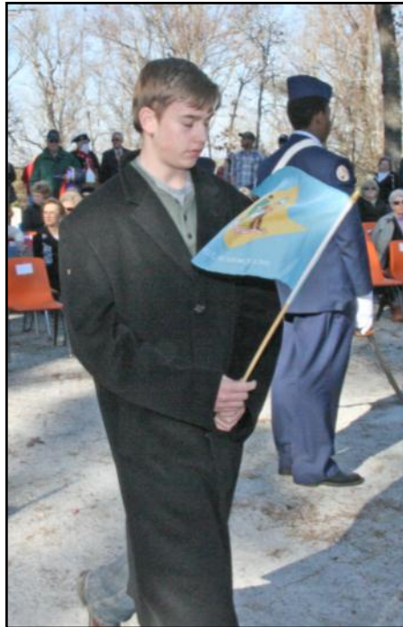
C.A.R. Members present flags of the thirteen original colonies