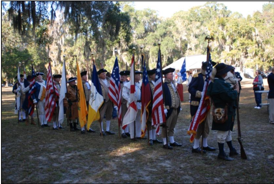
Georgia - Florida Color Guard—Continental