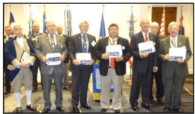
2014 Membership Streamer Chapters LtoR: Blue Ridge Mountains, Marquis de Lafayette, Wiregrass, Edward Telfair, Button Gwinnett, Athens (not shown) Altamaha