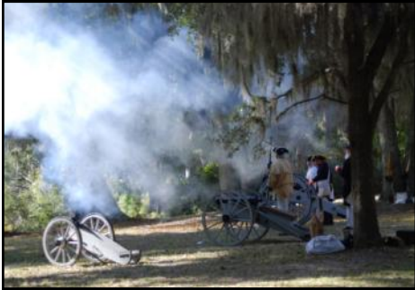
Cannon Salute by 2nd Georgia Artillery