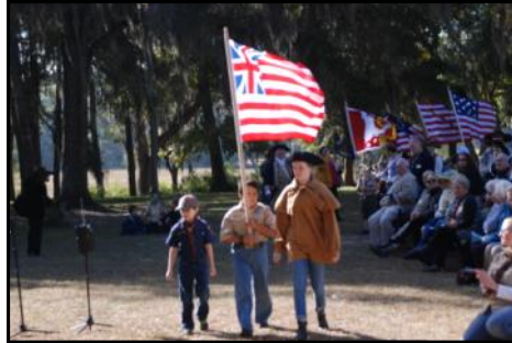
Presentation of Grand Union Flag by Scouts and C.A.R.