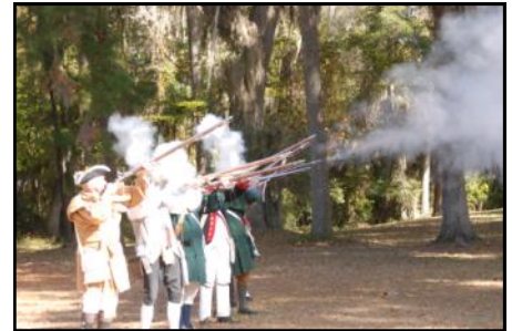
Musket Salute by Elijah Clarke Militia