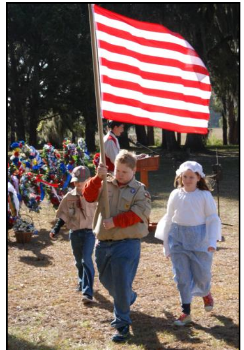
Presentation of Sons of Liberty Flag by Scouts and C.A.R.