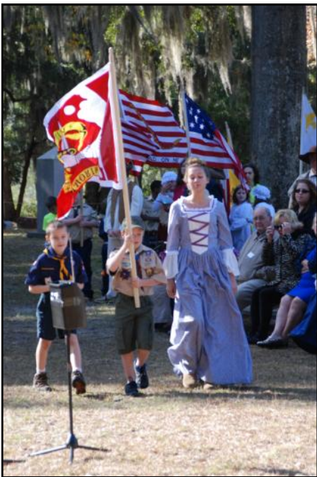
Presentation of Bedford Flag by Scouts and C.A.R.