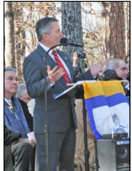
Representative Jody B. Hice of Georgia's 10 th Congressional District