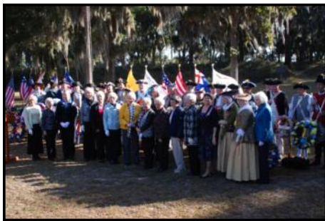
DAR Wreath Presenters and GA-FL SAR Color Guard