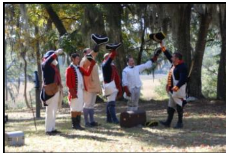
Huzzahs from 2nd Georgia Artillery