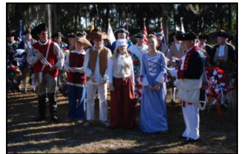
NSSAR President General with Georgia C.A.R.