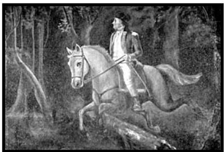
Stephen Heard, a planter, patriot, soldier, and Georgia governor (President of the Executive Council-1780, 81). Heard County, created in west central Georgia in 1830, was named in his honor.

2:00 pm. Oliver Gravesite at Stinchcomb Methodist Ch, 2069 Stinchcomb Road: GPS: N34 deg 08. 312' W82 deg 56. 622' Travel from Downtown Elberton northwest on GA HWY 17 about 5.1 miles to Deep Creek Road-careful- Hwy 17 splits from GA 72! (stay on Hwy 17). Turn left onto Deep Creek Road and travel about 1.8 miles to Stinchcomb Road. Turn Left onto 2069 Stinchcomb Road, travel .9 miles to church on your right.