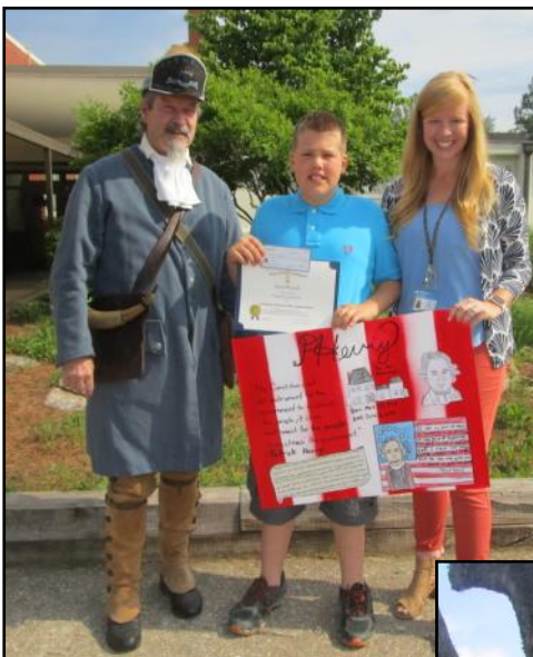
Poster Contest Winner