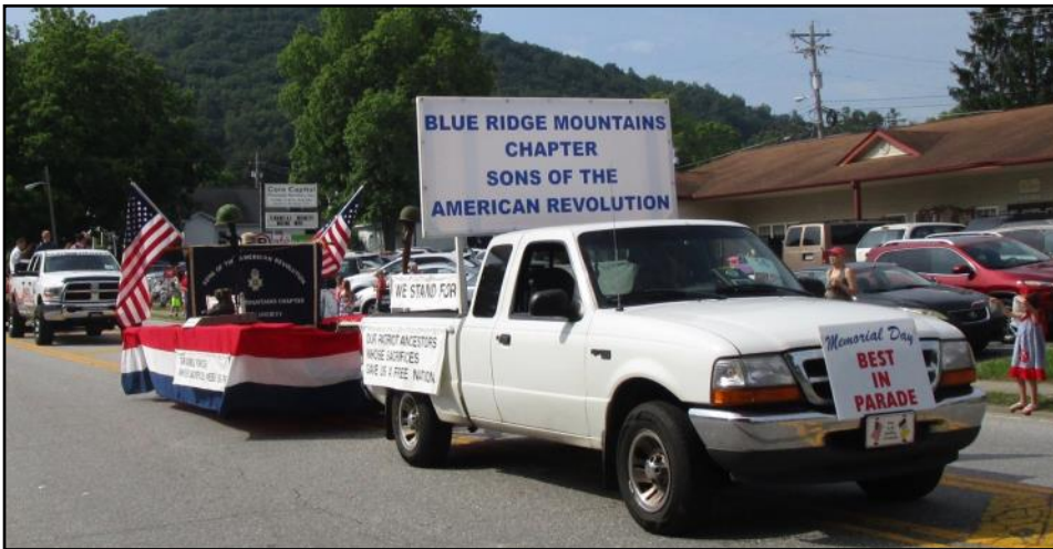
Memorial Day Parade “Best in Parade” Award