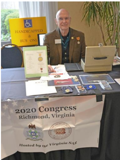
Members of the Virginia Society were present to offer Conference goers an opportunity to sign up for the 2020 Congress, to be held in Richmond, Virginia in July.