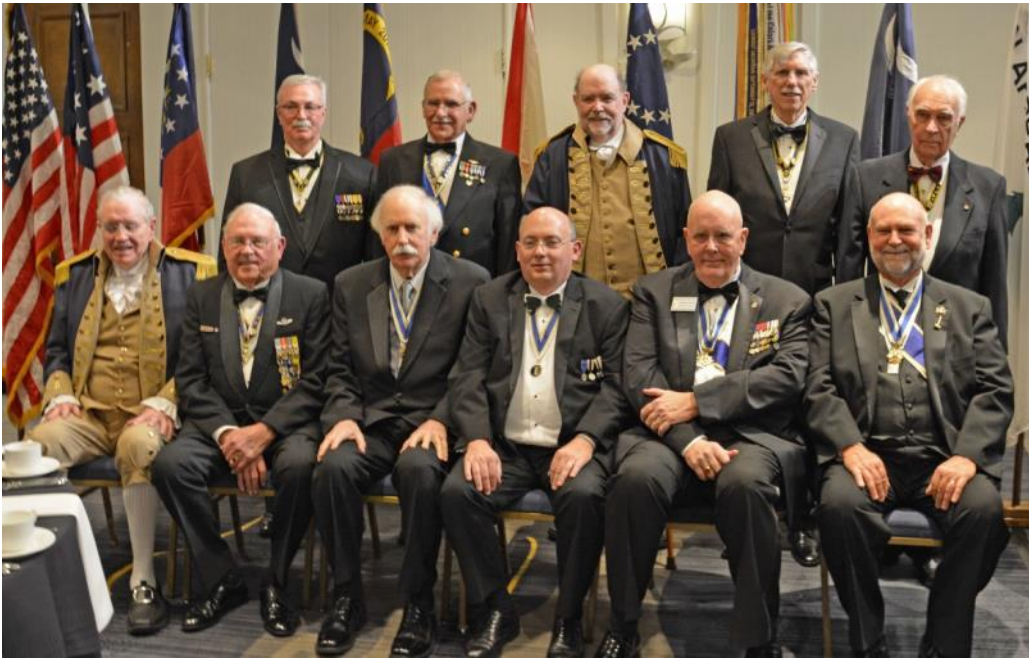
Georgia Presidents, current and Past, with President Generals attending the 2020 Annual Conference.