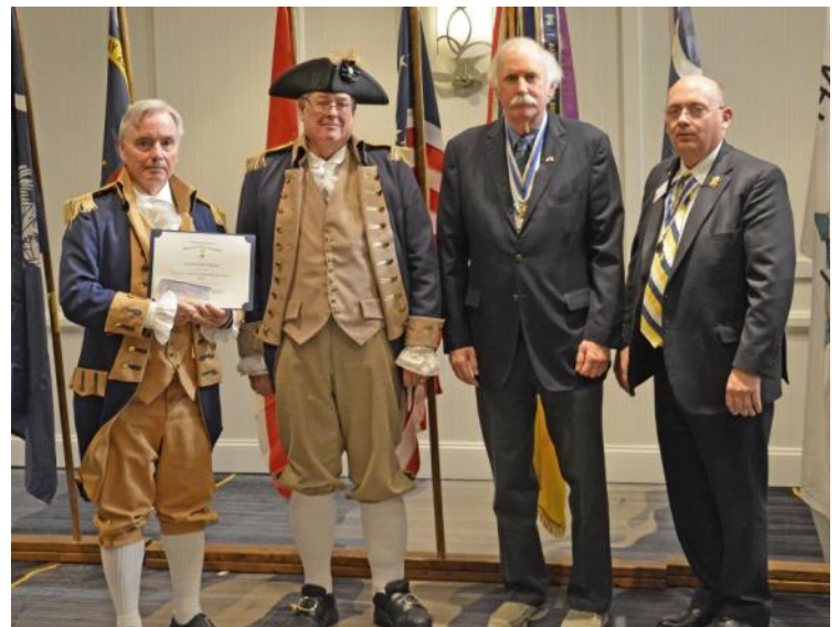
Left: John Dooly Education Outreach Award

This award goes to the chapter that has shown the most improvement in their GASSAR Education Outreach program during the current year from the previous year. A certificate and a $200 cash prize is awarded.