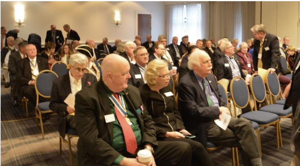
Centennial Ballroom is filled to overflowing by Compatriots and guest on Saturday morning for the Memorial Service.