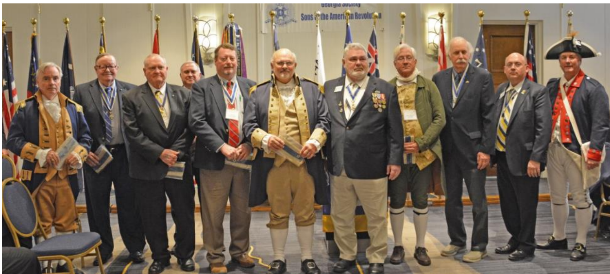
Left: President General Chapter of Distinction