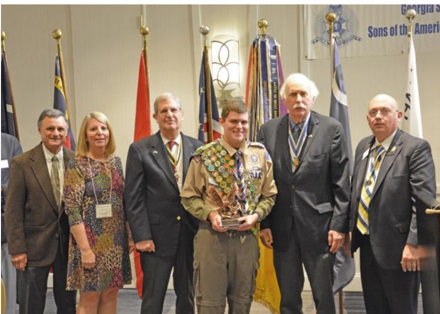
Left: Eagle Scout Award