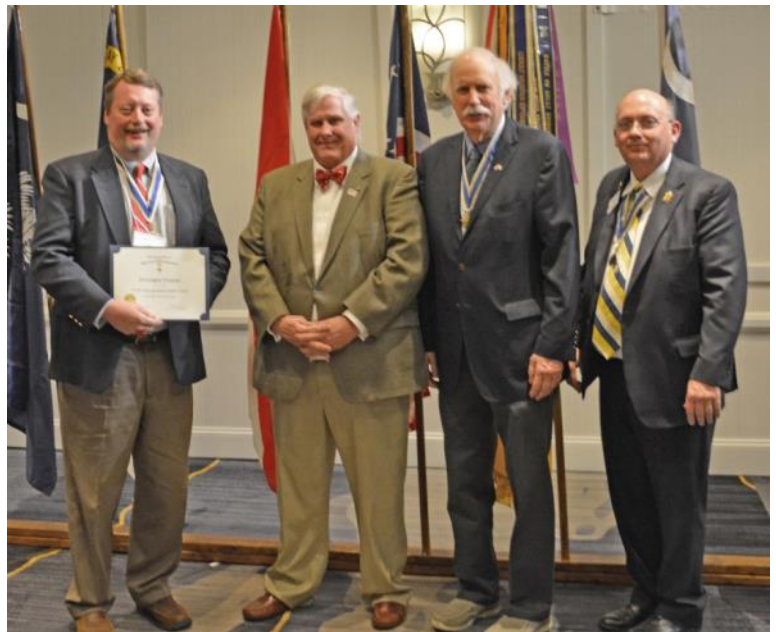
Below: Membership Committee Awards

They receive a certificate and a check for $100.