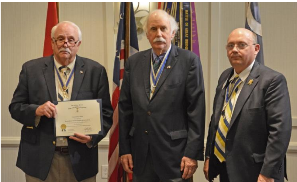
Above: Compatriot Graves Committee Awards

Wiregrass Chapter is awarded 2 Gold Stars and 2 White Stars.