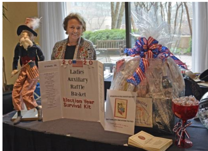
Registration, manned by Piedmont Chapter members. Next to Registration, the Ladies Auxiliary offered a fine basket of spirit warming items as a fund raising raffle.