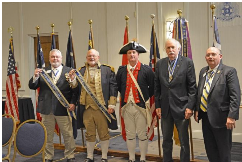
Left: Americanism Committee Awards

The chapter with the most Americanism points: Blue Ridge Mountains Chapter - 17,632 points