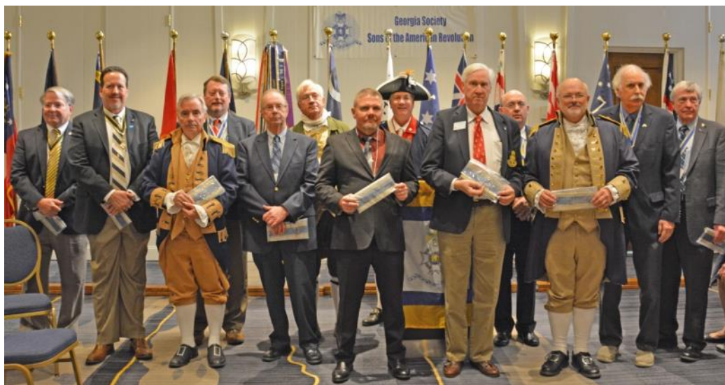
Left: Americanism Chapters of Distinction: