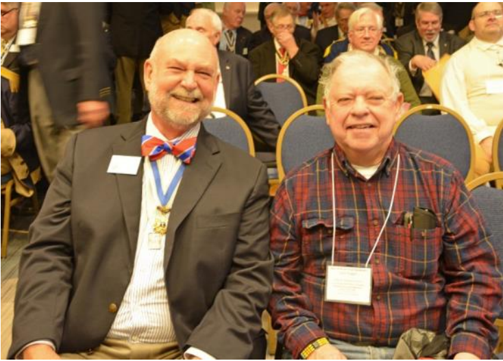
Left: Famous persons remain after the Memorial Service for the next session, the BOM meeting.