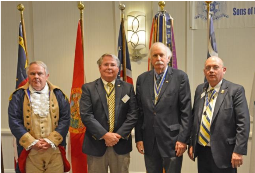
Left: Dr. Tom and Betty Lawrence American History Teacher Award