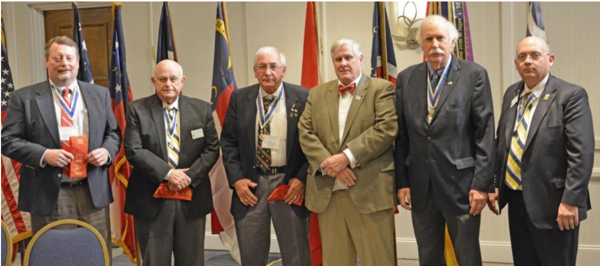
Above: Red C.A.R. Liaison Streamer Award

Ocmulgee Chapter Button Gwinnett Chapter Coweta Falls Chapter