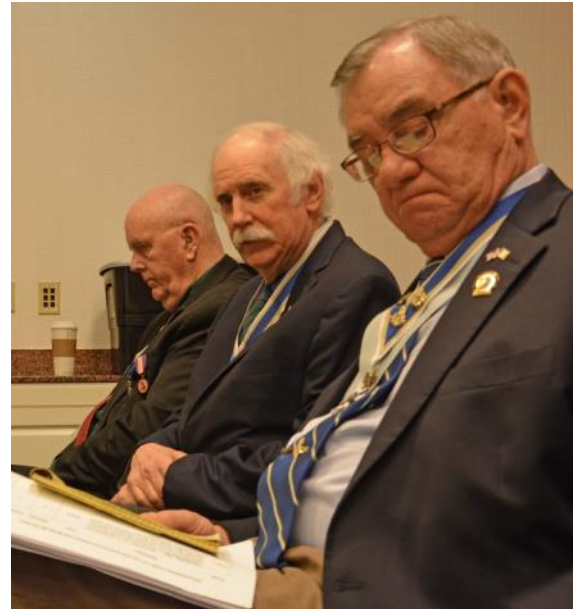
Right: Former Pres. Gen., current Pres. Gen., and Tres. Gen. NSSAR attended the BOM and gave greetings.