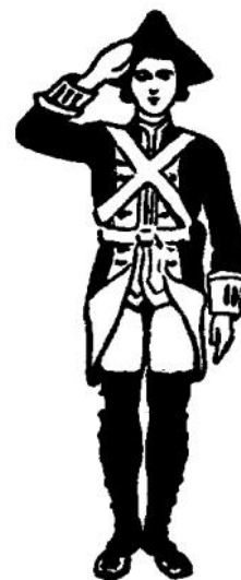
The Colors are retired as we come to the end of the evening's celebration.