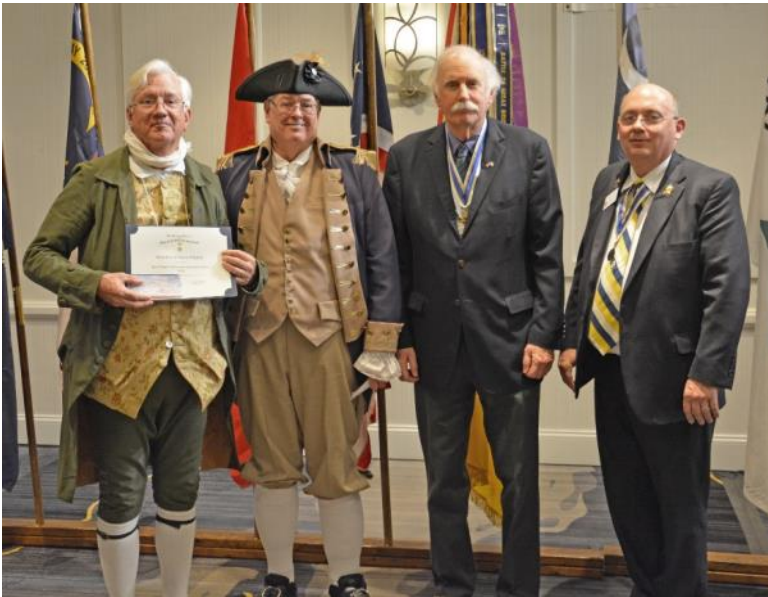
Left: Best Education Outreach Program Award