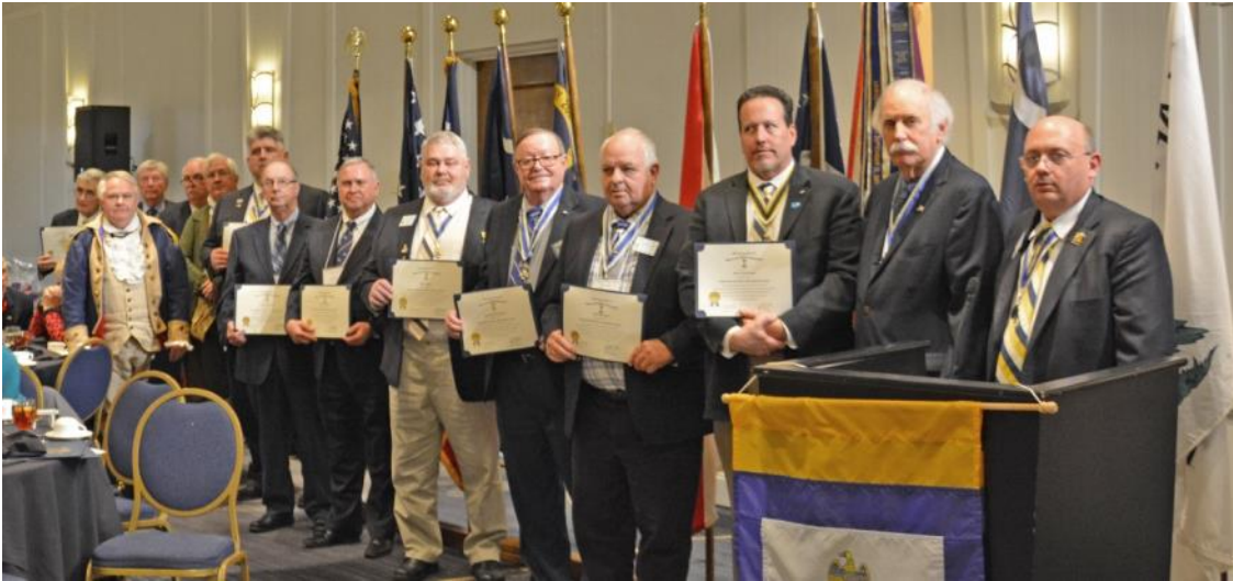
Left: Revolutionary War Patriot Graves Committee Awards

14 Georgia Society chapters honored 18 Revolutionary War Patriots buried in Georgia with SAR Patriot Grave Marking Dedications.