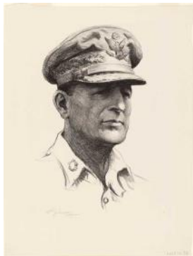
General Douglas MacArthur's image is on the Patriot Medal.