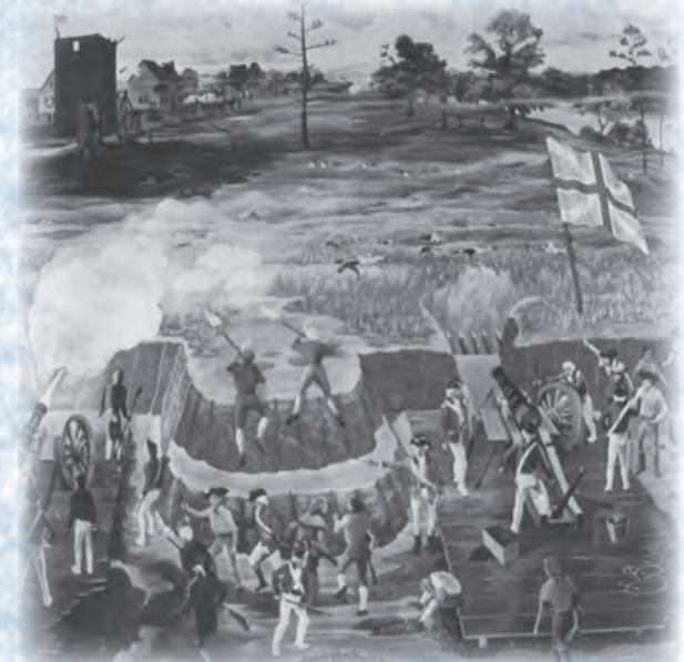
Siege of Fort Cornwallis, Second Battle of Augusta 1781 (Mayham Tower in left background)

"A war of extermination became the order of the day." – Lt. Colonel Henry "Light-horse Harry" Lee